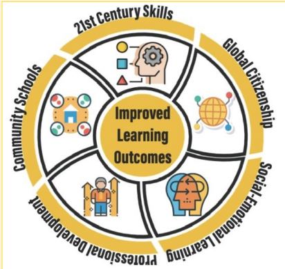
Strategic Plan 2021-2025