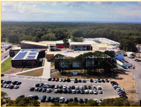
New NRHS Campus