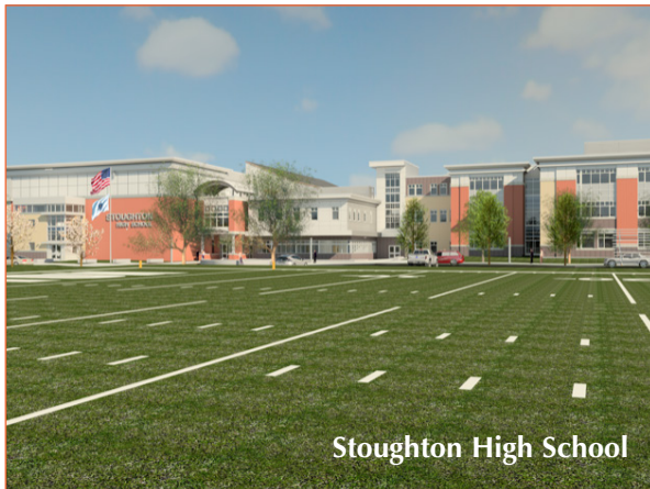
Stoughton High School